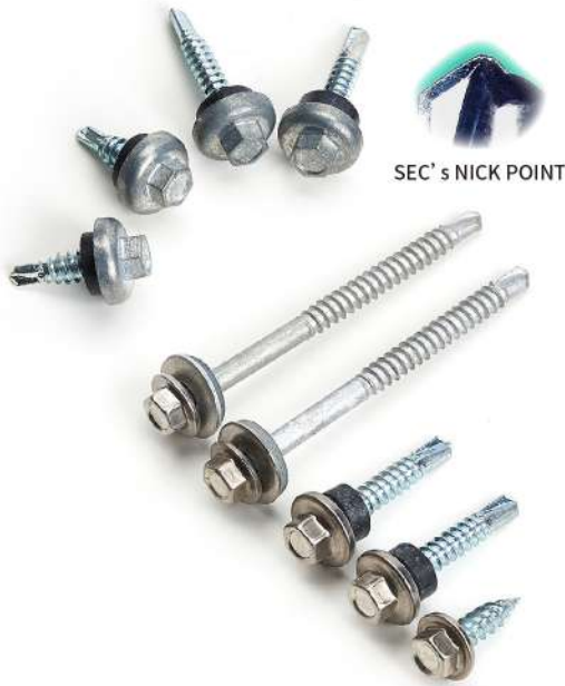
SEC'S NICK POINT

The unique riveting of the screw caps can withstand higher torque. This characteristic increases screws drilling successful rate and expands the application range.