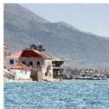
Highest corrosive environment